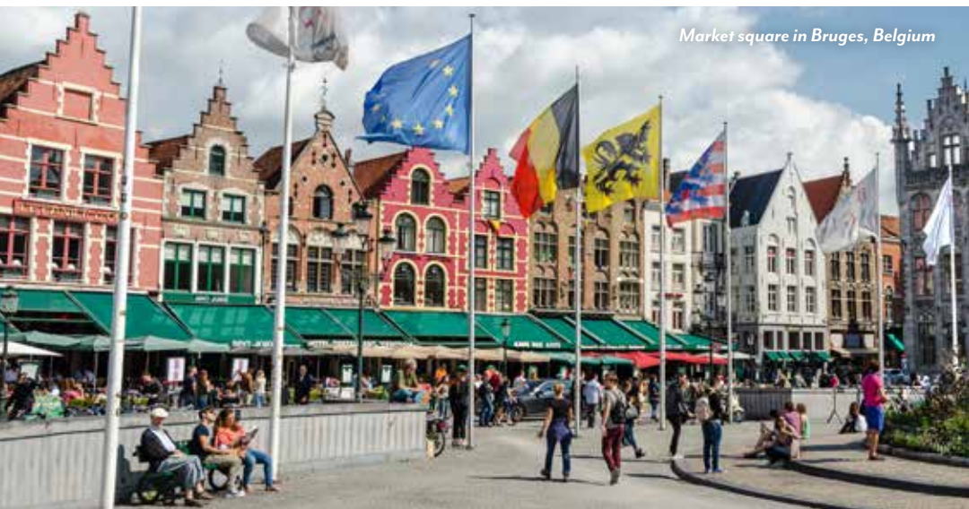
Market square in Bruges, Belgium

A scenic drive through Flemish countryside takes you to Bruges, where you'll enjoy a walking tour to the Gothic Town Hall, the famous and UNESCO-inscribed octagonal