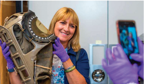
OUT OF THE VAULT MUSEUM TOUR WITH A MUSEUM CURATOR

Prominently located in the New Orleans Warehouse District and directly on the Museum campus, the Higgins Hotel & Conference Center features a striking 1940s theme and is part of the exclusive Curio Collection by Hilton. This 4-star hotel offers spacious and well- appointed accommodations, featuring 230 era-inspired guest rooms and suites, exceptional dining, and a state-of-the-art conference center, home to the Museum's many conferences, symposia, military reunions, student group visits, and student and teacher residential programs. Revenue generated by the Higgins Hotel helps fund the growth of the Museum's endowment and educational initiatives.