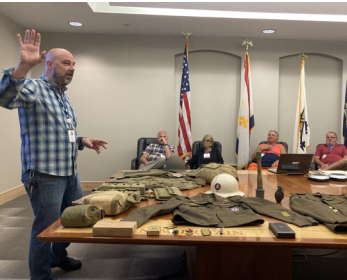
Out of the Vault Museum Experience

Breakfast at the Higgins Hotel. (Check-out time at the Higgins Hotel is 12:00 p.m.) Enjoy complimentary access to The National WWII Museum all day! (B)