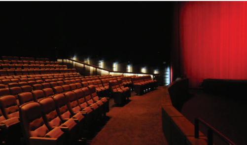
BEYOND ALL BOUNDARIES A UNIQUE CINEMA EXPERIENCE