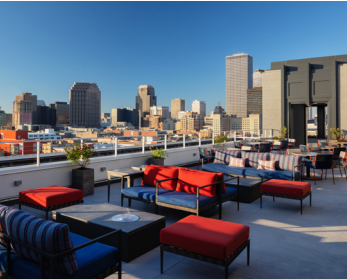
Rosie's On The Roof, Higgins Hotel

Arrive at The National WWII Museum and the Higgins Hotel New Orleans, Curio Collection by Hilton and check-in to the Higgins Hotel.