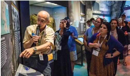
EARLY ACCESS TO CAMPAIGNS OF COURAGE GALLERIES