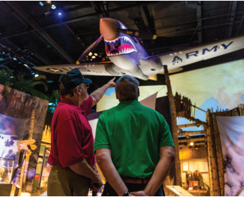
The Road to Tokyo Gallery, Campaigns of Courage