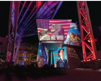
Expressions of America Experience On select departures only.