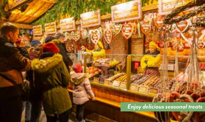
Enjoy delicious seasonal treats