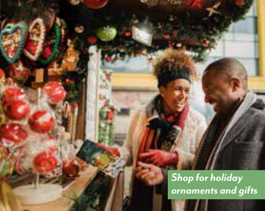
Shop for holiday ornaments and gifts