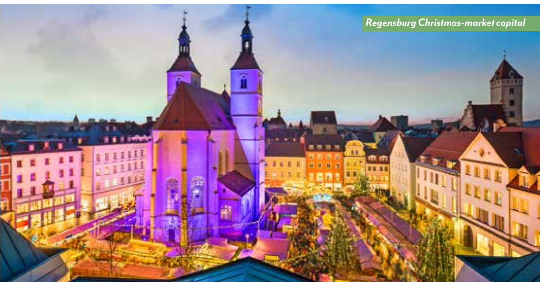
Regensburg Christmas-market capital

Disembark ship and transfer to Nuremberg Airport for your return flight home.