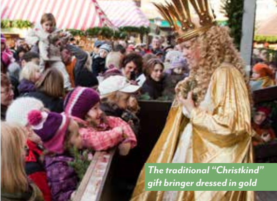
The traditional "Christkind" gift bringer dressed in gold