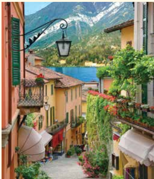
Cover photo: Enjoy a private boat ride across Lake Orta, an Italian Lake District hidden gem.

The safety and well-being of our travelers remains our highest priority. Cruise lines and some other providers of services (as well as, potentially, some countries) require all passengers traveling on our programs to present confirmation of a full COVID-19 vaccination, and, as well, passengers may have to produce evidence of a recent negative COVID test. All our staff are committed to adhering to all health and safety protocols from the start of your trip to the end as directed by the United States Centers for Disease Control and Prevention, overseas health officials as well as those protocols mandated by your cruise company (if applicable) and other suppliers of services. Detailed protocol information tailored to your travel program will be mailed to you along with additional pre-departure information.