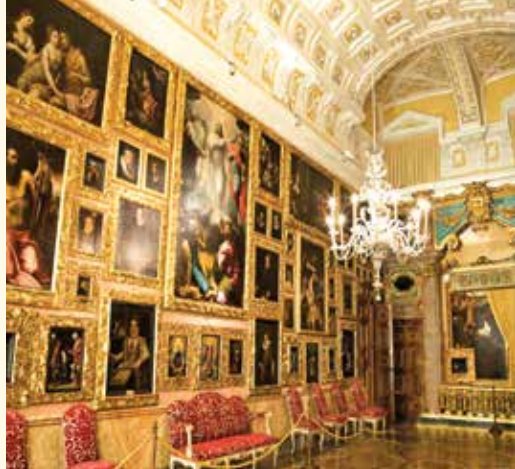
The Palazzo Borromeo showcases the works of Giulio Cesare Procaccini and Luigi Pellegrini Scaramuccia.