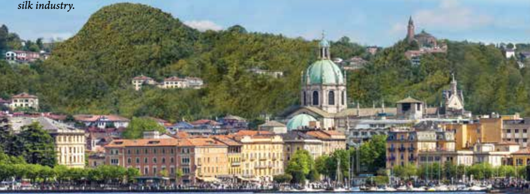
Photo below: Como's world-class architecture includes the Duomo di Como, financed by a prospering silk industry.

Photo above: The Teatro Massimo boasts the extravagant beauty of the Isola Bella gardens.