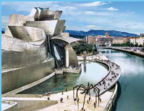
Bilbao's avant-garde Guggenheim Museum is wrapped in shining waves of titanium.

While cruising the dramatic west coast of France, attend an exclusive lecture on board by David Eisenhower.