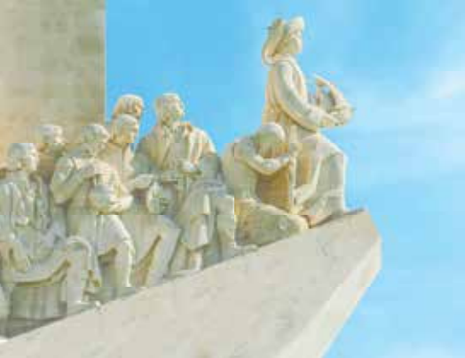
Lisbon's Monument of the Discoveries surveys the Tagus River's port and celebrates the Age of Exploration.

PRSR STD U.S. Postage PAID Gohagan & Company