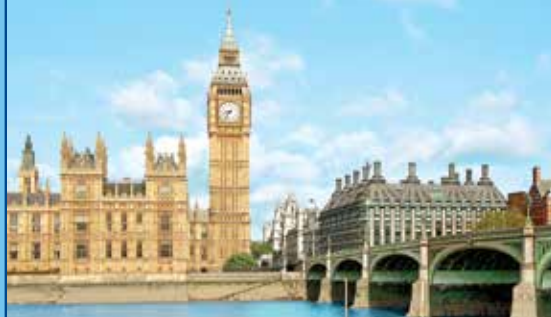
The Parliament, neighbored by 19 th -century Big Ben, was strategically built on the River Thames in 1016.

Resplendent palaces, magnificent churches and pastel-hued houses stand in testament to Lisbon's rich cultural heritage and quintessential charm. A historic gateway for world exploration and Portugal's intimate, welcoming capital, Lisbon is the ideal prelude to your cruise. Visit the UNESCO World Heritage sites of 16 th -century Jerónimos Monastery and the nearby forested village of Sintra, where the former Moorish fort is Portugal's last remaining medieval royal palace. Accommodations are for two nights in the deluxe DOM PEDRO PALACE HOTEL.