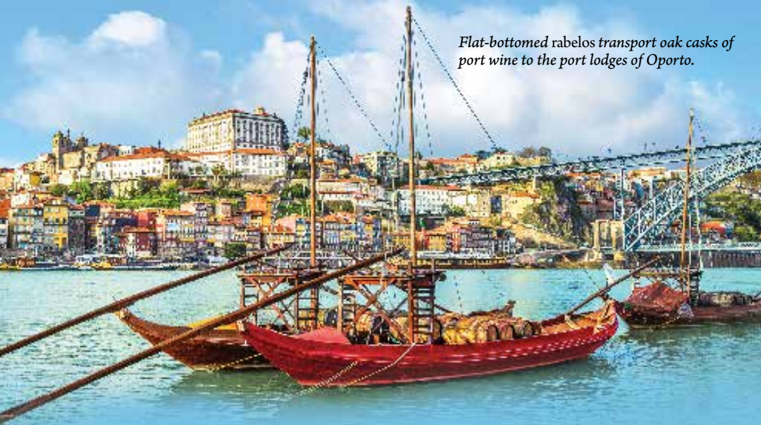
Flat-bottomed rabelos transport oak casks of port wine to the port lodges of Oporto.

Allied forces landed on D-Day. At Pointe du Hoc, envision the heroic U.S. Army Second Ranger Battalion scaling this cliff promontory, and survey the serene English Channel. Then, contemplate the solemn commemorative crosses and Stars of David in the American Military Cemetery at Colleville-sur-Mer.