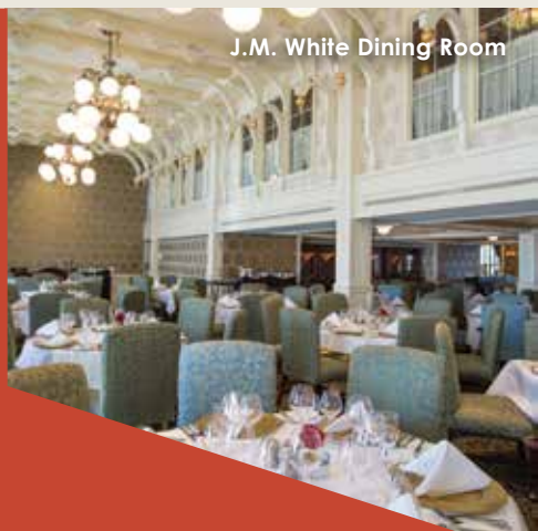
J.M. White Dining Room

Creating plates inspired by culinary classics of America’s South and utilizing the best of the season’s offerings from stops along the way, an award-winning culinary team lends its expertise to the unique dining experience on the American Queen . Indulge in the elegance of the J.M. White Dining Room, or satisfy your appetite any hour of the day at the Front Porch Café as you sample delectable creations, from pork loin stuffed with andouille sausage to corn fritters and bourbon pecan pie.