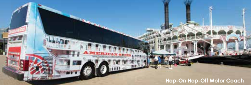
Hop-On Hop-Off Motor Coach