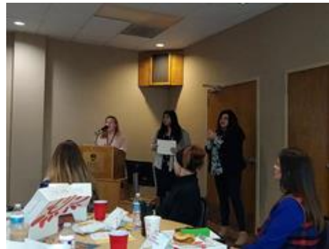
Social Work Club officers help lead Social Work Student Orientation.

We've found a way to ensure all students have an opportunity to attend at least one meeting each semester by rotating between days of the week. One of the six NASW ethical principles is the importance of human relationships, so we practice intentionality by planning strategically to ensure all students have the opportunity to engage and participate.