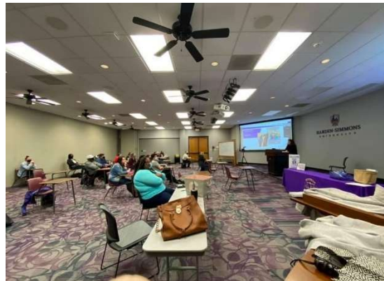
Social Work Club officers help to lead Social Work Student Orientation.

We’ve found a way to ensure all students have an opportunity to attend at least one meeting each semester by rotating between days of the week. One of the six NASW ethical principles is the importance of human relationships, so we practice intentionality by planning strategically to ensure all students have the opportunity to engage and participate.